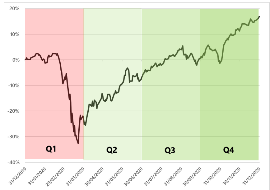
Figure 1: S&P Global Broad Market Index (BMI) cumulative total return in 2020

The difficulty with forecasting is laid bare when a year like 2020 comes along.